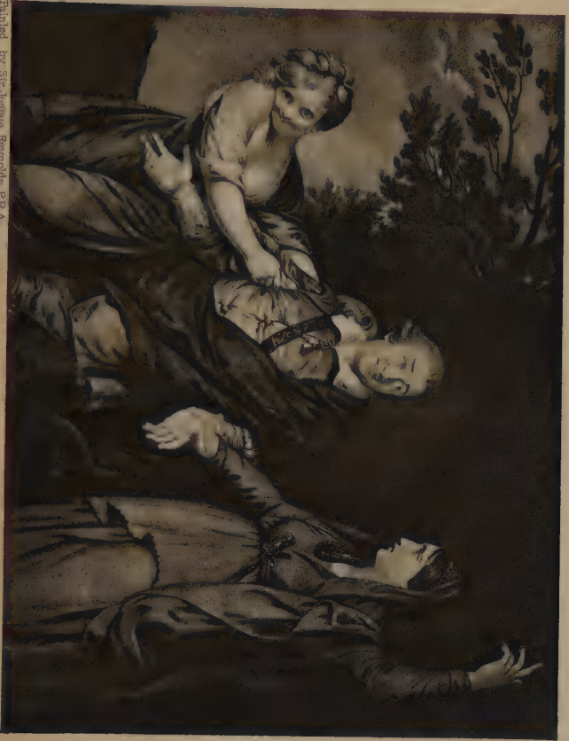
Painted by Sir Joshua Reynolds, P.R.A.